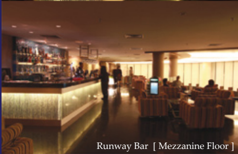
Runway Bar [ Mezzanine Floor ]